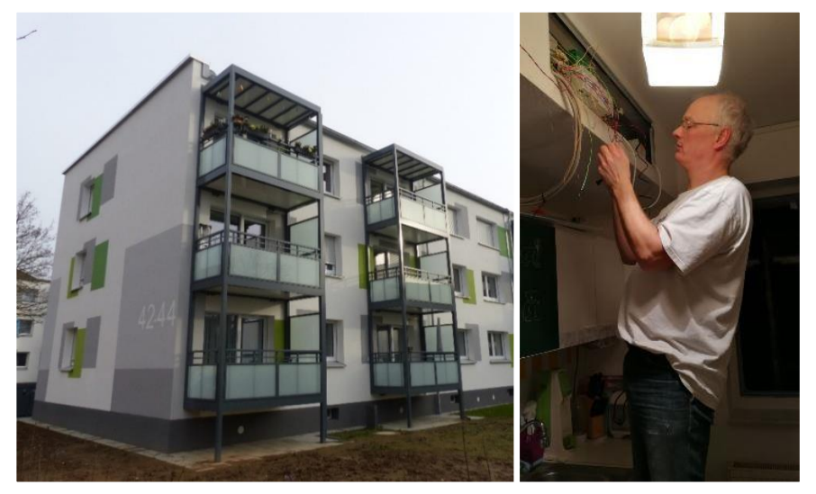
The deep retrofits using Passive House components significantly reduced the heating demand in this apartment block in Giessen. The Passive House Institute carried out scientific measurements, for which numerous cables and sensors had to be installed.

Darmstadt/Germany. After a deep retrofit, a typical apartment block from the post-war era has become a model for energy-efficient buildings. The Passive House Institute carried out scientific monitoring of the project in Giessen, Germany, and has now published its research report. The retrofit planning in advance using the PHPP tool showed a significant reduction in the