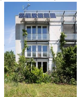
The world's first Passive House building in Darmstadt-Kranichstein.

The Passive House Standard already meets the EU requirements for Nearly Zero Energy Buildings. According to the European Buildings Directive EPBD , all member states must specify requirements for so-called NZEBs in their national building regulations. These came into effect in January 2019 for public buildings and will apply for all other buildings from the year 2021.