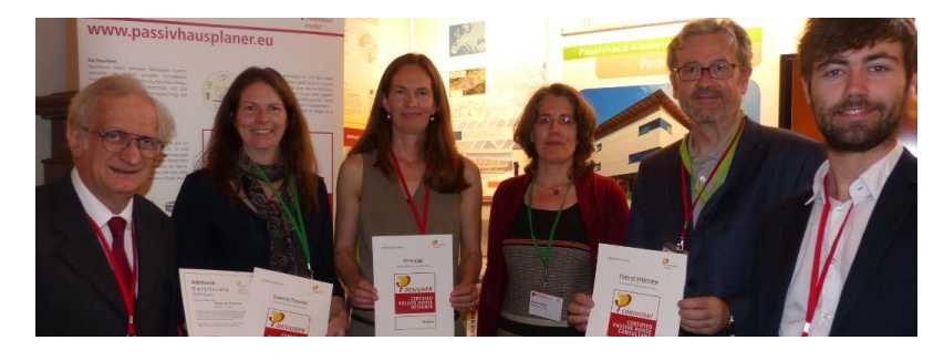
The attendees were very impressed by the Town Hall in Heidelberg (left). Many certificates relating to the certification of persons and Passive House components were also awarded by the Passive House Institute.