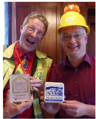
The winner of the German Passive House Slam (left).