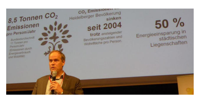
Heidelberg's Lord Mayor Eckart Würzner presented the Bahnstadt as the largest Passive House district currently, which has zero emissions. Würzner also elucidated the Master Plan for Climate Protection for the city of Heidelberg.

During this lively panel discussion the information that the subsequent costs for CO2 emissions of a building should be calculated into the construction costs was contributed by the audience. Architect Georg Zielke of Darmstadt pointed out that Passive House buildings do not have to be more expensive than conventionally built houses. He criticised the fact that current policies do not provide enough incentives for extremely energy efficient construction.