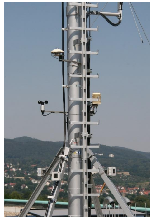
The antenna mast on top of the office building in North Hesse. The Passive House Institute installed equipment for monitoring the weather on it.