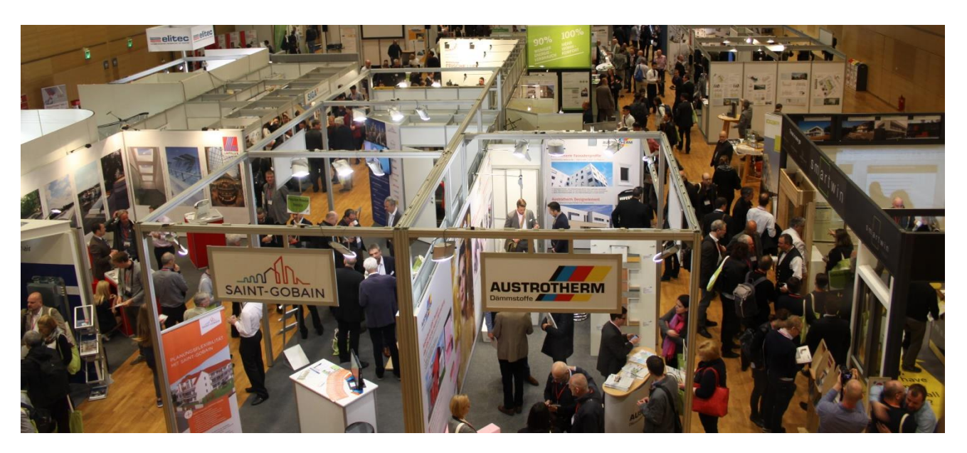
The Passive House exhibition at Messe Wien Congress Center, which takes place alongside the conference. More and more manufacturers are certifying their products. There are now over 870 certified Passive House components in the Passive House component database.