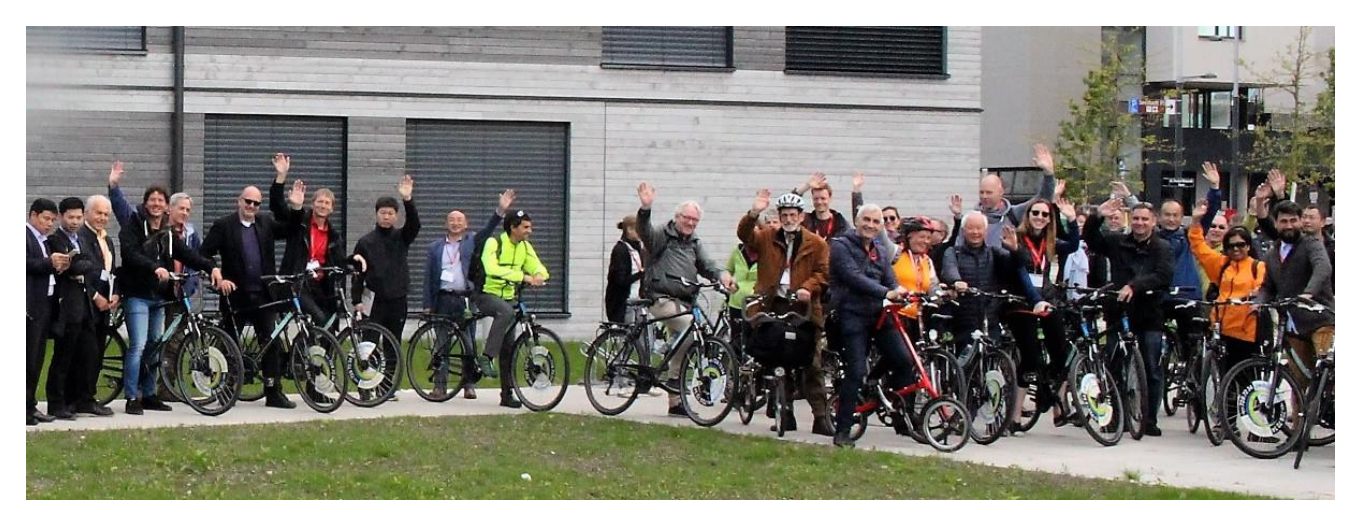
Fully satisfied: The 21st International Passive House Conference in Vienna with more than 1000 participants from over 50 nations was a complete success. Eight excursions to 40 exciting Passive House projects in Vienna and the surrounding area were also part of the program. These participants were part of the 30km Passive House bike tour.