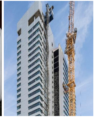
Three Passive House presentations (f.l.t.r.): Passive House Temple Tochoji in Tokyo (© Tochoji Temple), mobile Passive House from the 3D printer (© PHI) and Passive House high-rise Cornell Tech in New York (© Lester Ali).