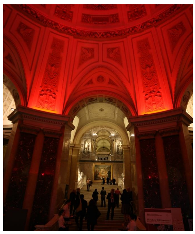
Another highlight of the conference: The evening event at the Vienna Natural History Museum.

At the 21<sup>st</sup> International Passive House Conference, the politicians in Vienna made it clear that particularly in cities there continues to be a great need for energy efficient living space to be made available, also for the general public. The Director of the Passive House Institute,