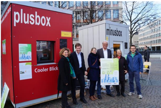
Group photo with the Mayor of Darmstadt Jochen Partsch in front of the "mini-house" for the ice block competition.