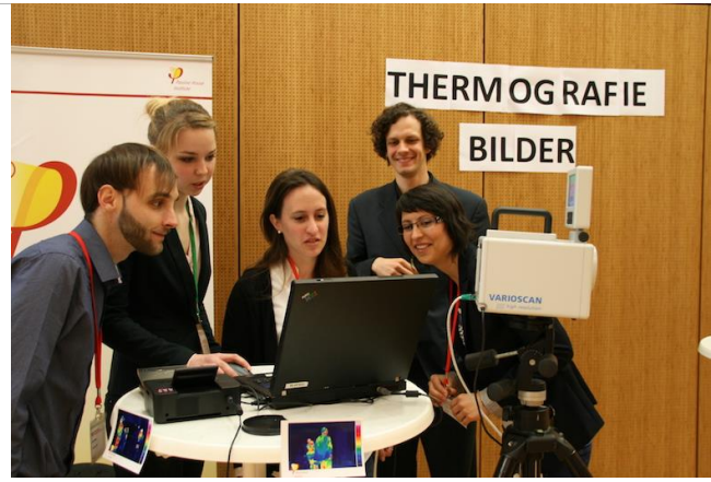
Exhibition visitors testing the thermographic imaging camera.

The regional focal points in the experts' presentations were China, North America, and the Mediterranean region among others. Of the approximately one thousand Conference attendees, about 200 visitors came from China. In North America the focus is currently on the construction of the world's first Passive House skyscraper in New York. The first certified Passive House buildings in Greece and Turkey were presented during a lecture session on the Mediterranean climate – several years of experiences already exist with projects in Spain and Italy.