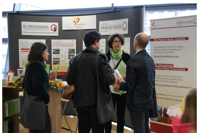
Conference visitors at the Passive House Institute's stand.