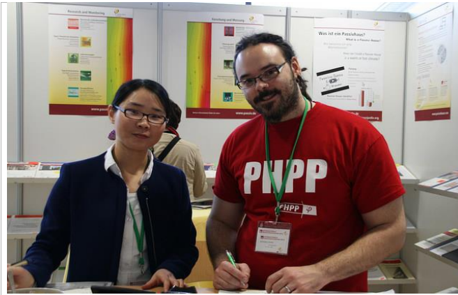
Presentation and sale of the planning tool PHPP, for the reliable projection of the energy balance of buildings.