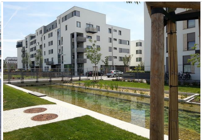
The Passive House urban settlement Bahnstadt in Heidelberg – one of the destinations of the excursions that took place after the Conference.

Over a third of the total energy consumed in industrialised countries is used for building operation, mainly for heating and cooling. About 85 percent of this energy on average can be saved with the Passive House Standard. Additional investment for a Passive House construction are usually amortised within a few years due to the low running costs. Of course, the heating consumption will remain low even after this time. This principle is therefore extremely attractive for building owners in economic terms.