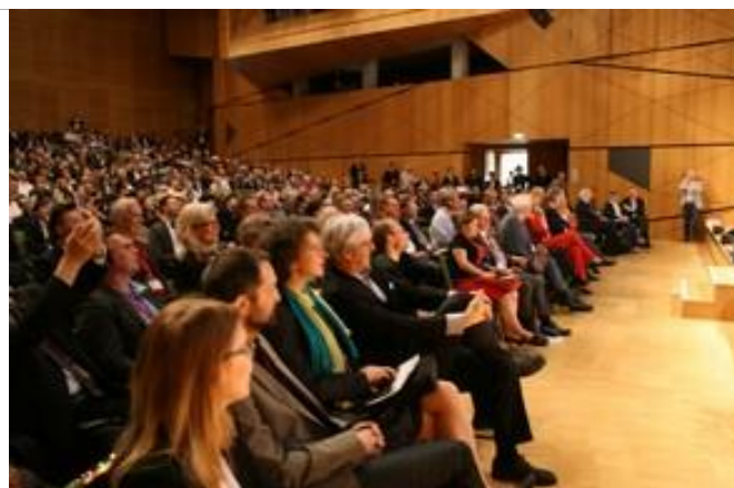
Full plenary session at the International Passive House Conference.