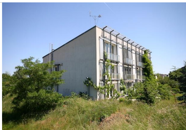
The world's first Passive House building in Darmstadt-Kranichstein.