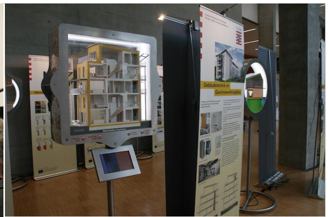
Models illustrating the Passive House principle.

Further information: www.passivehouse-conference.org