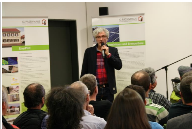
The Passive House Forum for building owners in the region.