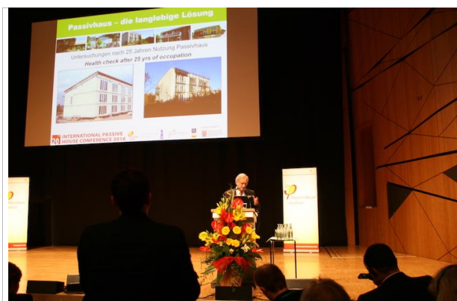
Presentation of the follow-up study for the world's first Passive House building.