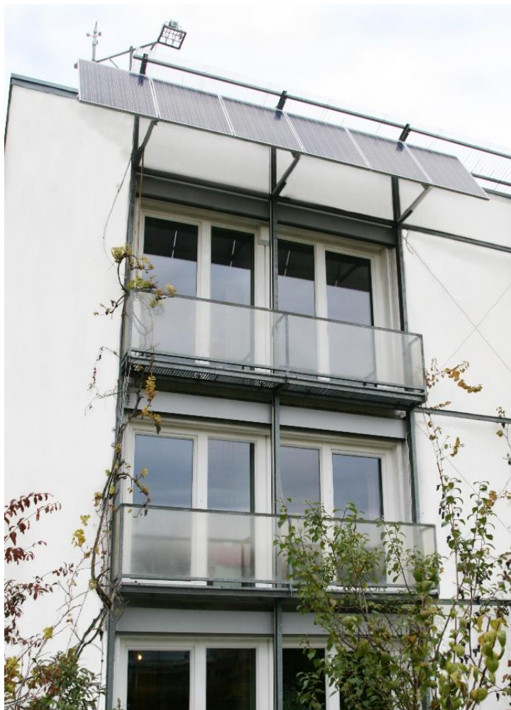
The building's two-part solar photovoltaic system covers 26 square metres and is mounted on the terrace as well as on the roof.

housing complex in the Darmstadt city district of Kranichstein. In the year of its 25th anniversary, the Feist family installed a photovoltaic system on the roof of their house with a surface of 26 m 2 in order to utilise the sun's energy.