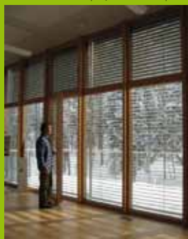
Trebersburg & Partner Architects ZT GmbH | Austria